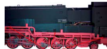
Remove the water box (three detent mechanisms must be removed on each side to this end)