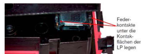
Federkontakte unter die Kontaktflächen der LP legen

The loudspeaker (without sound capsule, dimensions 15 x 11 x 6.8 mm, item no. 396491) is now positioned in the recess in such a way that the two contact springs are located below the existing contact surfaces on the printed circuit board.