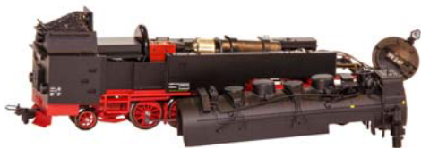
Remove the boiler upwards

Then pull off the driver's cab upwards from the model. Following this also pull off the boiler upwards. Now carefully remove the coil insert or the oil tank upwards. The coal insert / oil tank is snapped into place. Now detach the water boxes from the vehicle frame and remove them. To this end three detent mechanisms must be carefully detached on each locomotive side.