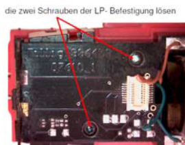
die zwei Schrauben der LP- Befestigung lösen

Following this detach the two screws of the circuit board and then lift off the board upwards