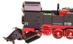
Pull off the coal / oil attachment upwards